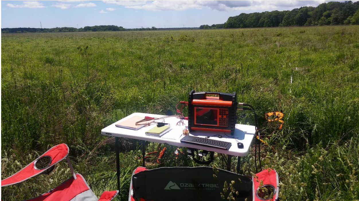
Another Deep TDEM sounding Wading River, NY (June, 2018)