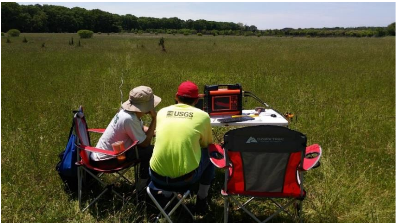
Deep TDEM sounding Wading River, NY (June, 2018)