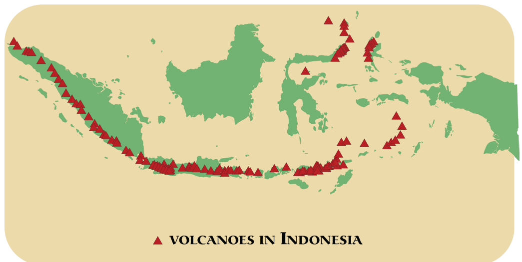
Map of volcanoes in Indonesia.

VDAP is the only international volcano crisis response team that rapidly deploys experts, donates and installs monitoring equipment, and works with international counterparts to keep eruptions from becoming disasters. VDAP supports in-country scientists and agencies at the host country’s request.