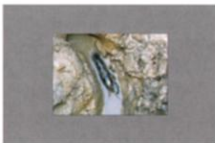
Numerous species of crayfishes spend all or a significant portion of their lives in subterranean burrows. Basic ecological information can be very hard to collect for these species.