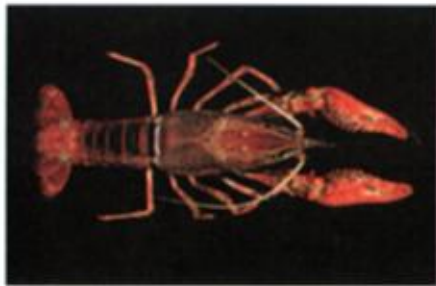
Over 70,000 metric tons of the red swamp crayfish ( Procambarus clarkii ) are harvested each year for human consumption.

(Decapoda Cambaridae) in Arkansas, with the descriptions of two new species and a key to the members of the gracilis group in the genus Procambarus . Proceedings of the Biological Society of Washington 101:391-413.