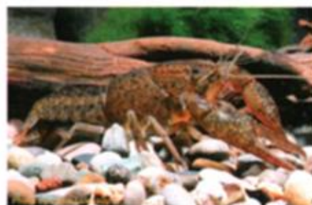
The eastern red swamp crayfish, Procambarus troglodytes , is a Currently Stable species found on the Atlantic Slope of Georgia and South Carolina.