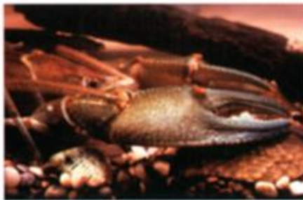
The bottlebrush crayfish ( Barbicambarus cornutus ) is currently stable and found in the Green River drainage of Kentucky and Tennessee.