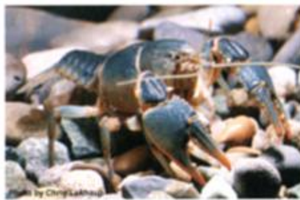
Cambarus cymatilis , a burrowing species ranked as Endangered by the AFS Endangered Species Crayfish Subcommittee.