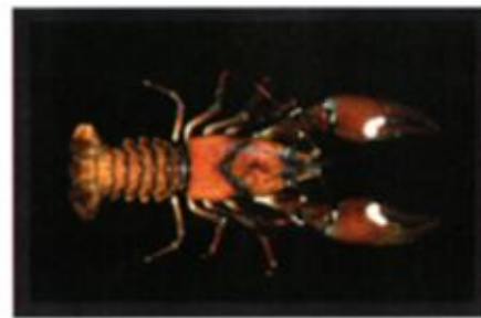
The signal crayfish ( Pacifastacus leniusculus ) is a widespread species found in the Pacific Northwest and is harvested for human consumption in parts of its range.