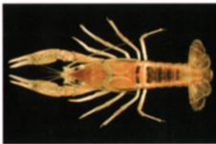
While generally inhabiting lentic habitats, a few members of the genus Procambarus , such as P. lophotus shown here, can occur in high gradient streams.