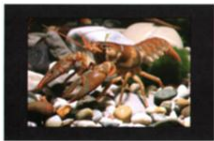
The St. Francis River crayfish, Orconectes quadricornis is a species classified as Threatened due to its narrow range and the establishment of nonindigenous species near its range.

To allow state natural heritage programs across the United States to make comparisons between AFS Crayfish Subcommittee ranks and heritage ranks, we have also included the conservation ranks for each taxon following the system developed over the past 25 years by The Nature Conservancy/NatureServe and the Network of Natural Heritage Programs (Master 1991; Appendix 1). This system ranks taxa on a 1 to 5 (1 being the rarest) scale based on best available information and considers a variety of factors including abundance, distribution, population trends, and threats ( www.natureserve.org/explorer/ranking.htm ). Since our assessments are based on the statuses of crayfishes across their entire