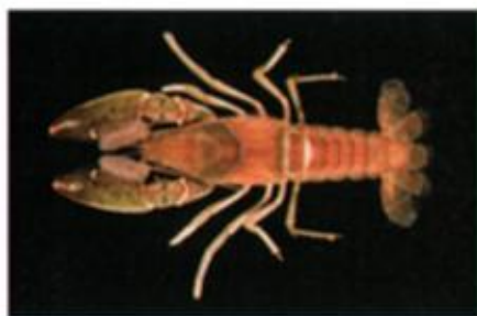
Procambarus escambiensis is an endemic species found in narrow region of the Gulf Coastal Plain of Alabama and Florida.

While the introduction of nonindigenous crayfishes through their use as bait continues to represent a significant threat to crayfish biodiversity, the Internet revo-