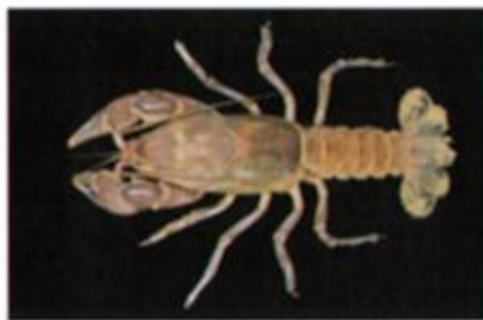
Members of the genus Fallicambarus , such as the burrowing bog crayfish ( F. burrisi ) here, are all burrowing species.

While little research is being conducted in Canada at present, its crayfish fauna was