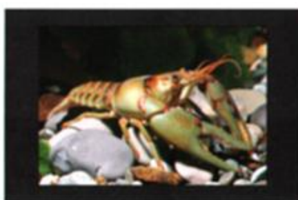
Over 50% of crayfish species are classified as Currently Stable. The golden crayfish, Orconectes luteus is one of those.