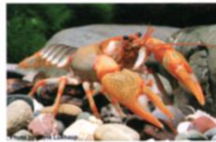
The greensaddle crayfish ( Cambarus manningi) is a Currently Stable species found in rocky creeks of the Coosa River drainage.