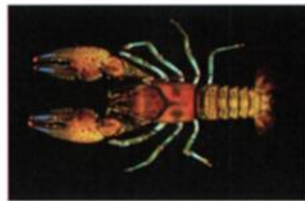
Meek's crayfish ( Orconectes meeki meeki) is a common inhabitant of Ozark streams in Missouri and Arkansas.