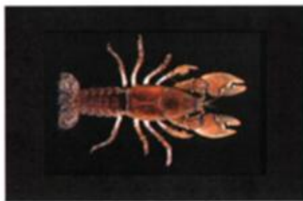
The digger crayfish ( Fallicambarus fodiens ) is one of the most widespread crayfish species in North America. It occurs from Ontario, Canada to Texas.

We provide this section to aid the reader in accessing additional information on crayfishes of the United States and Canada. The papers and Internet resources, organized alphabetically by state, are primarily taxonomic or distributional in nature but also cover topics associated with a variety of aspects of the biology of crayfishes. Additional crayfish information can also be found by following links found on some of the websites listed below.