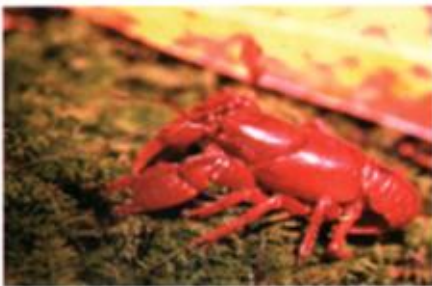
Cambarus carolinus is a burrowing species found along the margins of Appalachian streams in North Carolina, South Carolina, and Tennessee.

Taylor et al. (1996) pointed to the broad disparity in the recognition of actual or potential imperilment of crayfishes between governmental agencies charged with protecting natural resources and non-profit conservation organizations as a rationale for their conservation assessment. At that time, only four crayfish species ( Pacifastacus fortis , Cambarus aculabrum , Cambarus zophonastes , and Orconectes shoupi ) received protection under the federal Endangered Species Act of 1973 (ESA) and 47 species received varying levels of protection at the state level. This was in stark contrast to the 197 species listed by Master (1990) as in need of conservation attention. Taylor et al. (1996) surmised that 48% of the U.S. and Canadian crayfish fauna was imperiled. While some changes have been made at the state level (see below), the number