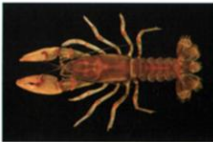
Since 1996 several species such as the rusty gravedigger ( Cambarus miltus ) have had their conservation statuses downgraded due to intensive field surveys.

on nomenclature, distribution, and conservation. Florida Scientist 53:286-296