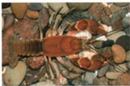
The Short Mountain crayfish ( Cambarus clivosus ) a narrowly endemic species found only in central Tennessee and ranked as Threatened.

RESUMEN: En el presente trabajo, El Comité para el Estudio de Especies Amenazadas de la Sociedad Americana de Pesquerías presenta una lista de todos los langostinos (familias Astacidae y Cambaridae) presentes en los Estados Unidos y Canadá, que incluye nombres comunes, distribución estatal y municipal, una revisión del estado de conservación de todos los taxa y referencias sobre su biología, conservación y distribución. La lista incluye 363 langostinos autóctonos, de los cuales dos taxa (< 1%) se catalogan como amenazados, posiblemente extintos; 66 (18.2%) se consideran en peligro; 52 (14.3%) están amenazados; 54 (14.9%) son vulnerables; y 189 (52.1%) se encuentran actualmente en condición estable. El principal factor responsable de la vulnerabilidad de los langostinos es su limitado rango natural de distribución; otras amenazas incluyen la introducción de especies foráneas de langostinos y la alteración del hábitat. Si bien se ha progresado en cuanto al reconocimiento de las amenazas hacia los langostinos, aún existe mucho trabajo por hacer.