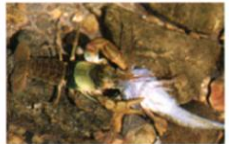
Crayfishes have historically been classified as opportunistic omnivores; however, our expanding knowledge of crayfish ecology indicates that they may be primary carnivores in some streams.