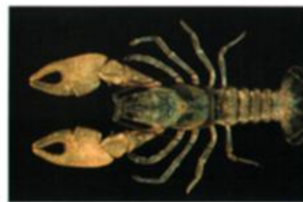
The Barren River crayfish, Orconectes barrenensis , is a species that occurs under gravel and cobble in creeks and rivers in the Barren River drainage of Kentucky and Tennessee.