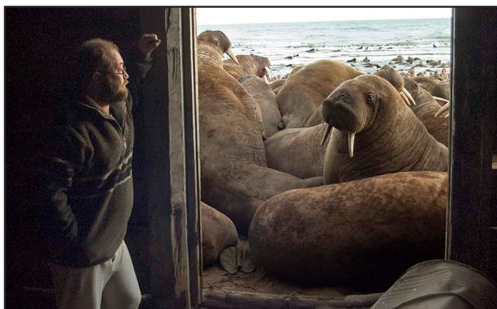
Russian Wildlife Biologist Anatoly Kochnev observing a very large walrus haulout at Cape Serdtse-Kamen' October 13, 2009, during a dedicated walrus haulout monitoring effort.