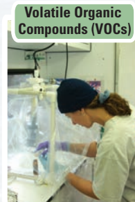
Volatile Organic Compounds (VOCs)