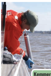
Kemmerer (depth specific) water-quality sampling