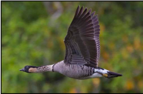
Nene goose in flight.

In August 2013, an adult nene from Hawaii died of lymphoma, a cancer of blood cells. In September, 2013, a critically endangered Rota crow died from liver cancer. These two cases were unusual in that cancer is rare in wildlife in general. Most wild animals do not live long enough to get cancer and usually die from things like starvation, trauma, or infectious diseases.