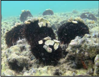
Collector sea urchin or Hawae.

A Quarterly newsletter of the Honolulu Field Station, part of the USGS-National Wildlife Health Center in Madison, WI